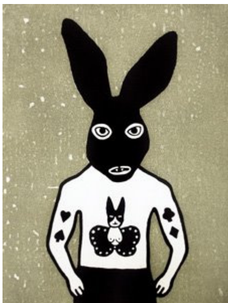
Lagomorphia etching 38 x 28 cm edition 40