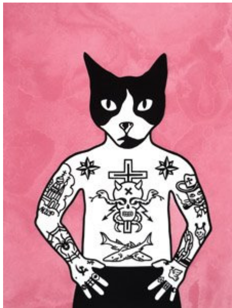
Leonid 2008 linocut and intaglio 76 x 56 cm edition 30

DD: OK - here is the last question and I will let you get on with your day... Finally, the more I look at your work, the more I see a very masculine sexiness in some of your "characters". Seriously - if "Leonid" (below) or "Theodor" were real tattooed men, I would be featuring their pics on my blog! First of all, am I completely imagining this sexual/sexiness of these images, or am I just some kind of perverted weirdo? And if I'm not imagining it - what role does sexuality play in your work?