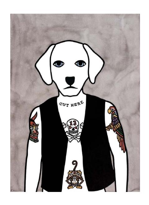
anticlockwise from top left Crazy Daisy , Theodor and The Duke 2008 linocuts, watercolour & ink 76 cm x 56 cm each edition 13