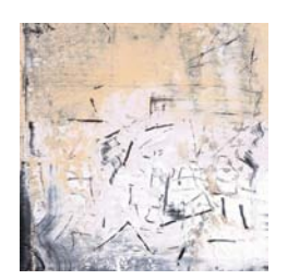
Bruno Leti Lotus (detail) archival digital print 17 x 15