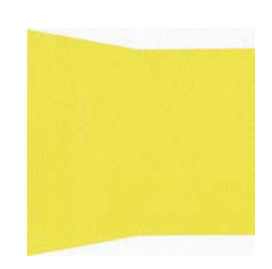
Louise Blyton Remembrance (detail) screenprint 25 x 25 printed by Cat Poljski