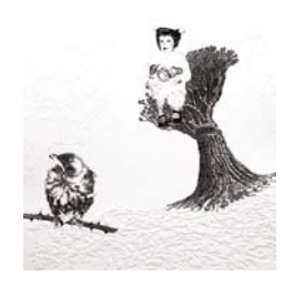
Glenn Dalton untitled photocopy transfer & blind embossing 25 x 25