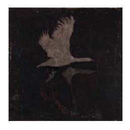
Martin King study for burnt creek offering archival digital print 18 x 18