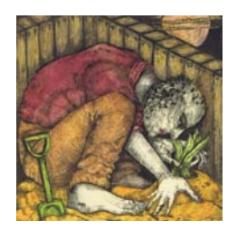
Juli Haas nurturer (detail) drypoint & hand colouring 13 x 10