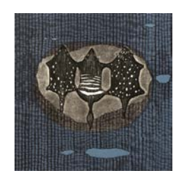
Annette Cook Messengers linocut, stencil, etching & aquatint 25 x 25