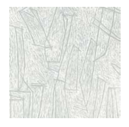
Andrew Gunnell pillar shift (detail) wood engraving 13.6 x 12.2