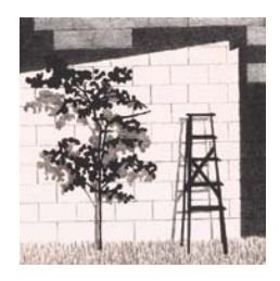
Kylie White Almost Always There (detail) lithograph 13 x 14