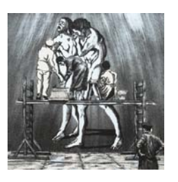
Eolo Paul Bottaro The Expulsion lithograph 25 x 25 printed by Peter Lancaster