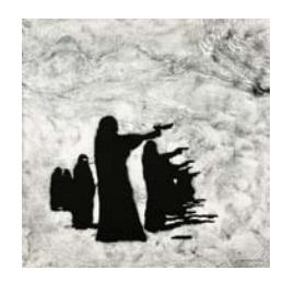
Jackie Hocking rebels don't create troubles, troubles create rebels lithograph 25 x 25