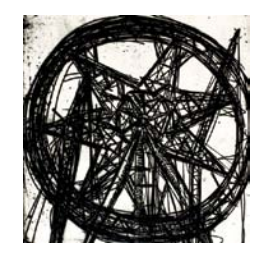
Marco Luccio the wheel (detail) drypoint 24 x 20