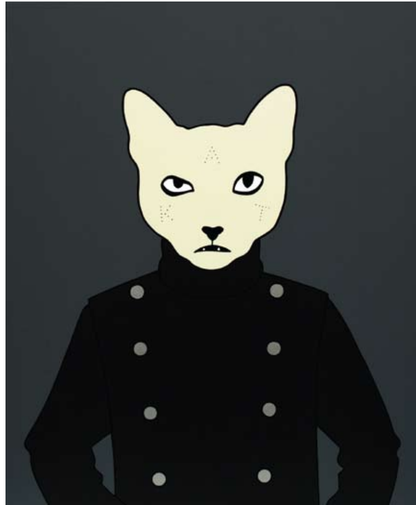
Qazaq 2011 acrylic on canvas 87 x 71 cm