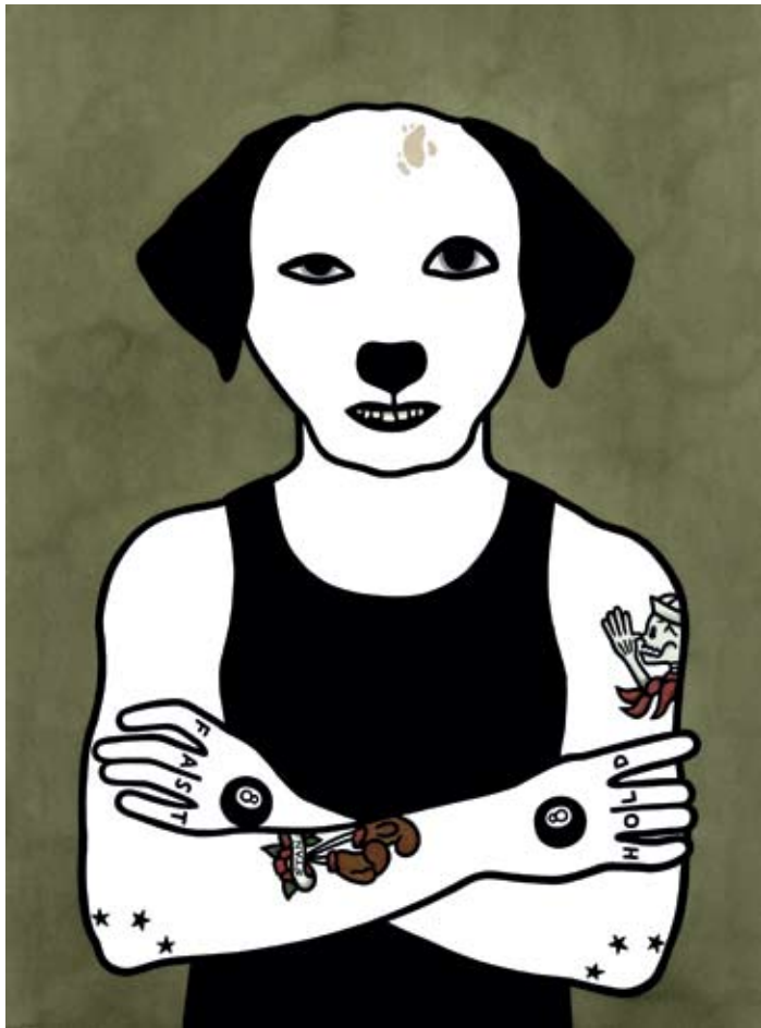
Dusty Rhodes 2011 linocut, ink and watercolour 76 x 56 cm edition 23