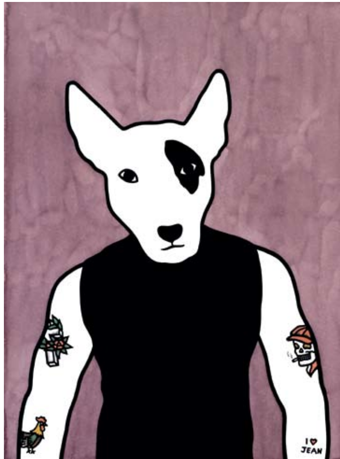
Jacky 2009 linocut, ink and watercolour 76 x 56 cm edition 13