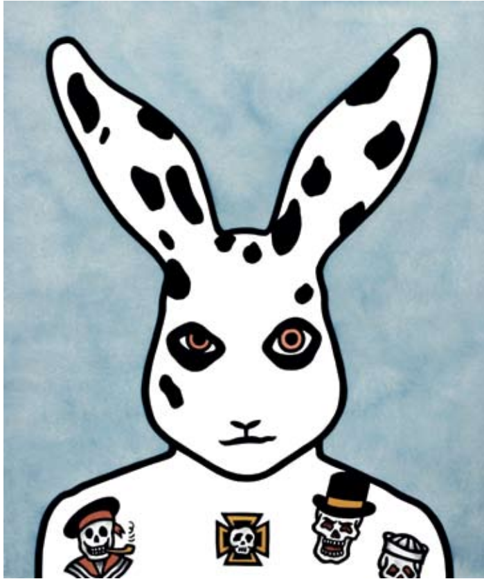
Vernon 2009 linocut, ink and watercolour 45 x 38 cm edition 13