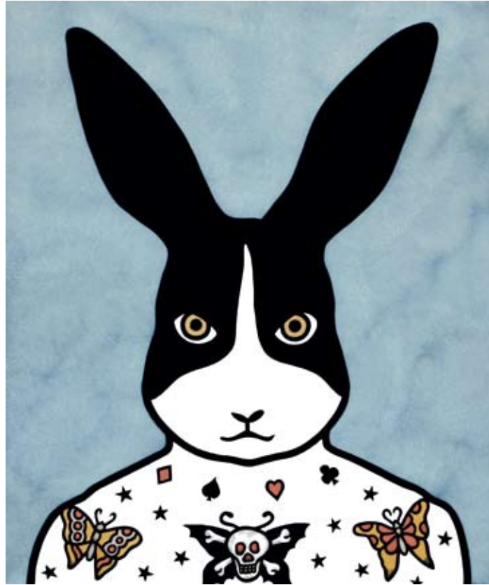
Dutch 2009 linocut, ink and watercolour 45 x 38 cm edition 13