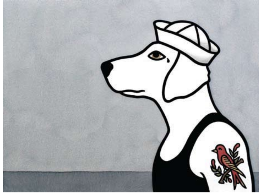
Our Frank 2010 linocut, ink and watercolour 28 x 38 cm edition 23