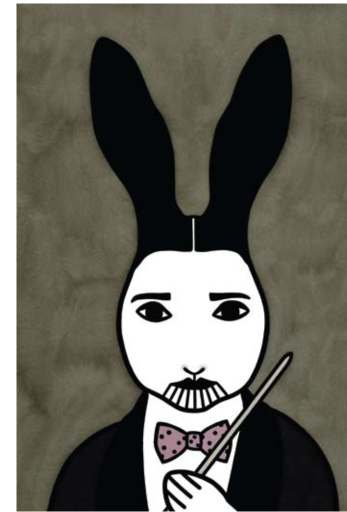
Maestro 2011 linocut and ink 55 x 38 cm edition 23