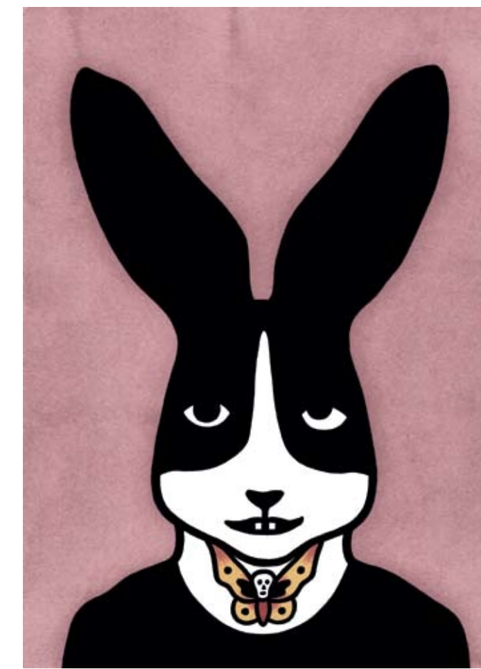
B.B. 2011 linocut, ink and watercolour 26 x 19 cm edition 23