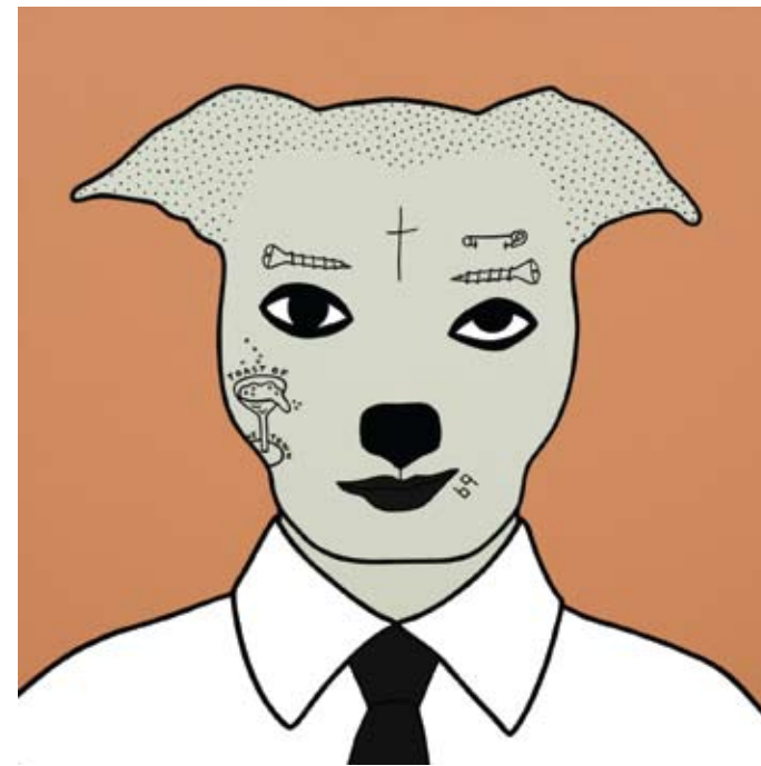
Mr Correct 2011 acrylic on canvas triptych, each panel 76 x 76 cm